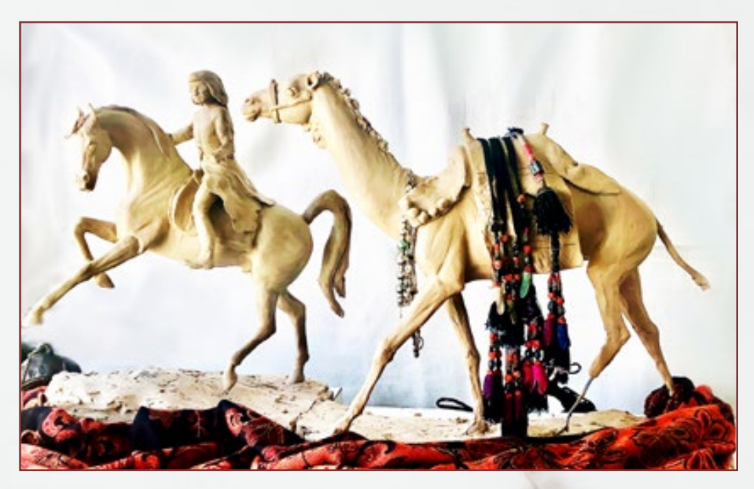
"Desert Caravan" shown in the original clay model