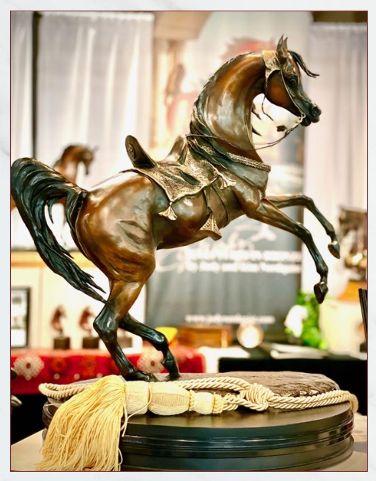
"Legends of the Sand"